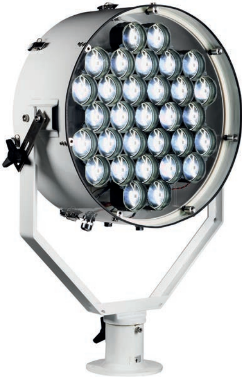
Virgo SS 450 LED D