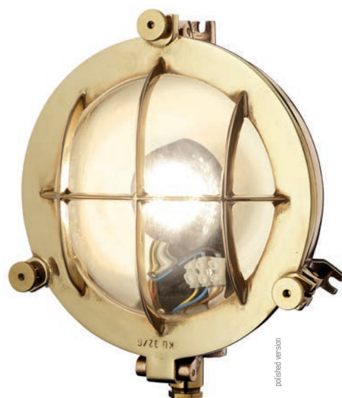
Pegasus LED Kit